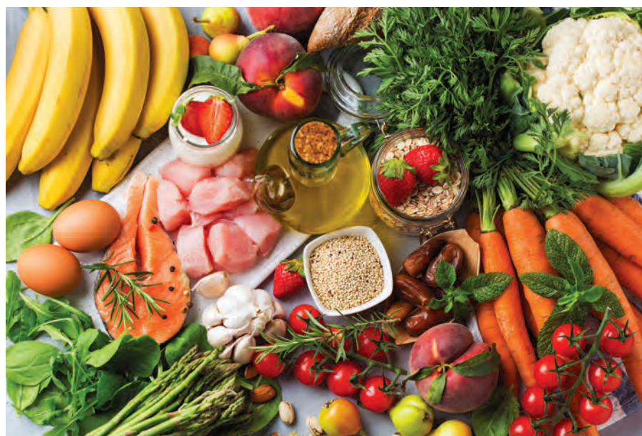
DASH focuses on low sodium, whole grains, and fresh fruits and vegetables.

The study was supported by the Department of Health, Jiangsu Province, China. The researchers had no financial conflicts to disclose. ■