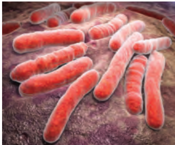
Image shows Mycobacterium tuberculosis .

Among patients assigned to the 8-week regimens, 80% stopped at exactly 8 weeks, while 9%