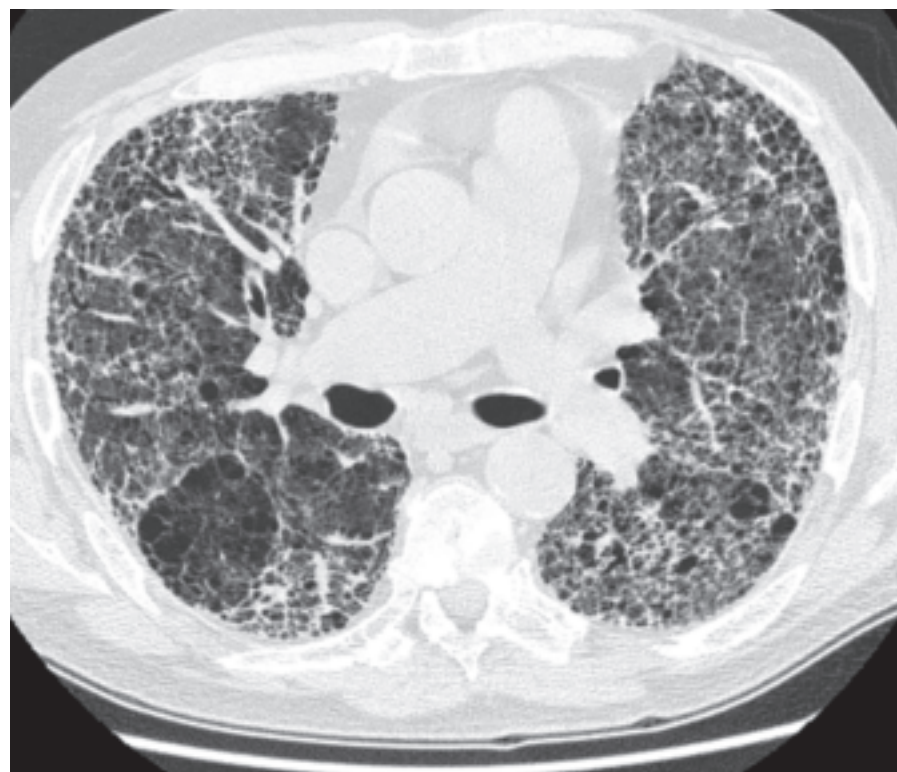
Sample scan of IPF

The patients were randomized to receive 200 mg oral ENV-101 daily (18 patients) or placebo (15 patients) for 12 weeks.